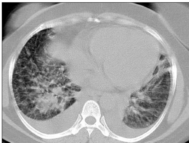
Figure 2. CT scan shows bilateral pleural effusion in the lower lung zones, areas of consolidation, and ground-glass opacity.